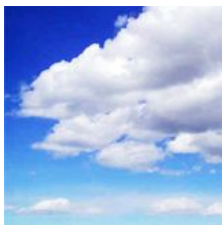
Stories from the Libraries Blog