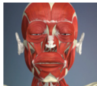
Follow Inside the Collections Blog