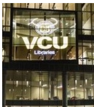
See What's on the Cabell Big Screen

Winter break and early 2017 brought fresh paint, new carpet and other improvements to the main study spaces—on the first floor and in the Special Collections and Archives Reading Room—on the MCV Campus library. New furniture was chosen to meet diverse study needs. These include booths, larger tables and flexible seating. See photos and updates