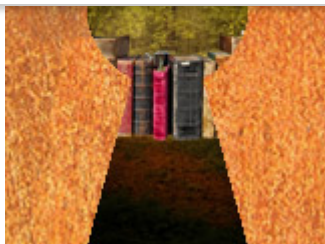
On Cabell Screen