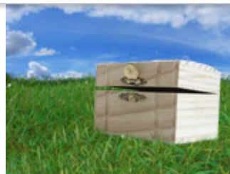
Inside the Collection