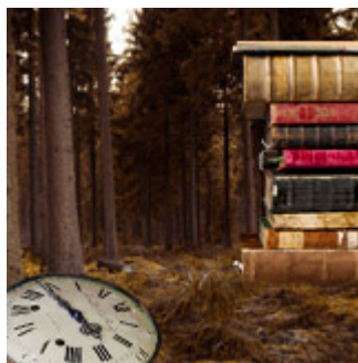
Stories from the Libraries Blog