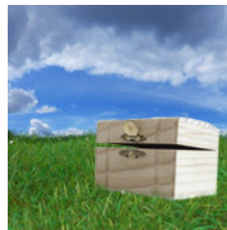
Follow Inside the Collections Blog