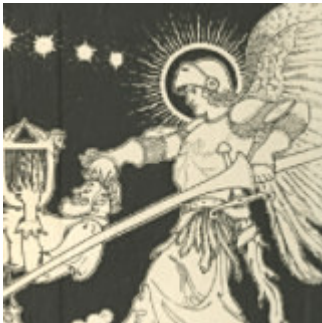
"Man of Letters & Libraries" Exhibit

Virginia Commonwealth University's newly expanded and renovated James Branch Cabell Library adds 93,000 square feet of new construction and 63,000 square feet of improvements to the existing Monroe Park Campus library, providing VCU's roughly 32,000 students with a library designed specifically to meet their needs for research, study and collaboration. Explore: A library transformed