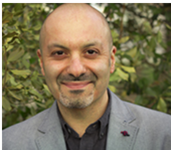
VCU Cabell First