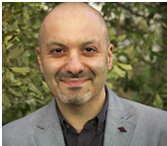
VCU Cabell First Novelist Award Night

VCU Libraries offers a long lineup of spring events with programs that cover topics ranging from sci-fi films to nursing, from graphic design to the Hebrew prophets. Our new events newsletter will help you mark the dates on your personal calendars . Please share the URL with friends. We look forward to seeing you this spring!