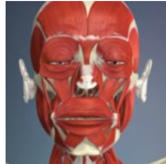
Follow Inside the Collections blog